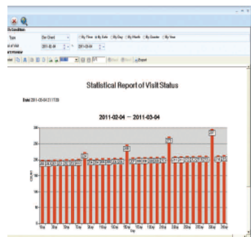
Statistical Report of Visit Status