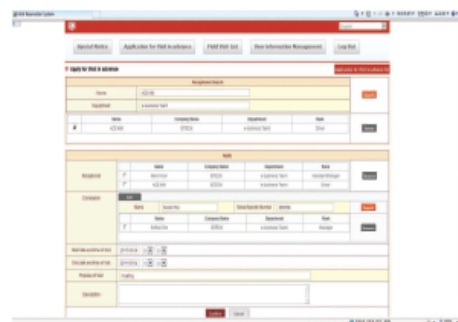
Web-Based Visitor Pre-Registration